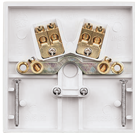
PRW017 - Rear View