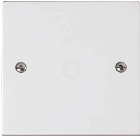
PRW017 - Front View