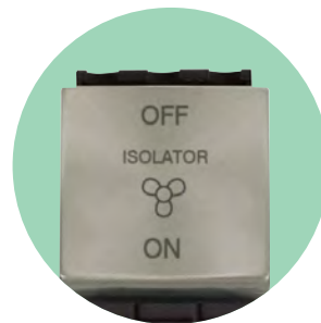
Brushed Steel (BS)