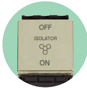
Polished Brass (BR)