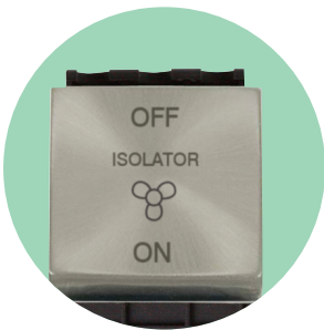
Satin Chrome (SC)