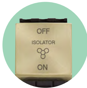
Satin Brass (SB)