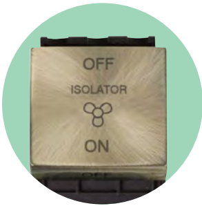
Antique Brass (AB)