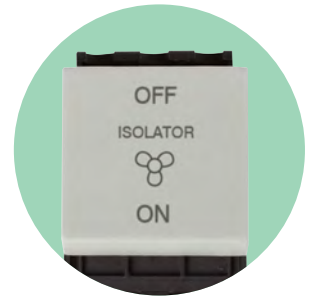
Click White (WH)