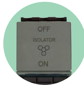
Black Nickel (BN)