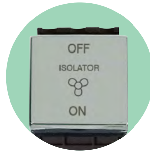
Polished Chrome (CH)