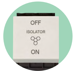
Polar White (PW)