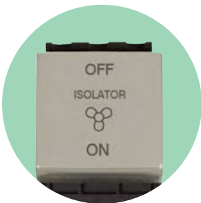
Pearl Nickel (PN)