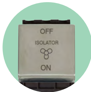
Stainless Steel (SS)